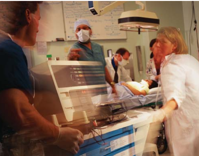
Heroes on Medicine's Frontline